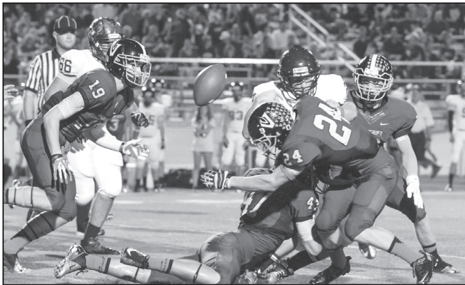
Vandegrift's defense forces a fumble during last year's game against Dripping Springs. If a new-look defense can gel quickly and continue forcing turnovers — a Viper staple — Vandegrift will be a force in District 25-5A.