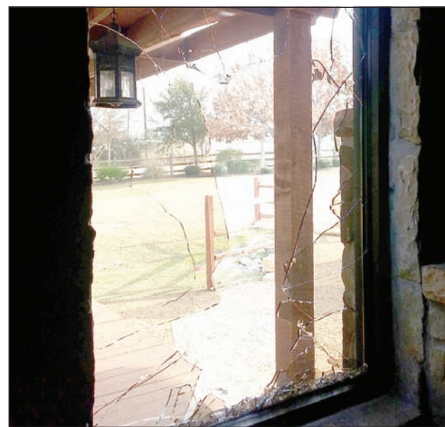
A rock was thrown through a window at La Fuente's over the weekend and alcohol was taken.